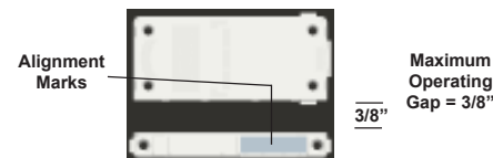
Figure 2. ELK-6021 Mounting Gap and Alignment