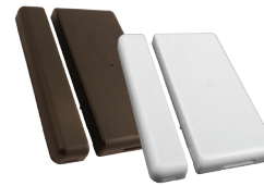
ELK-6021 (White) ELK-6021BR (Brown)