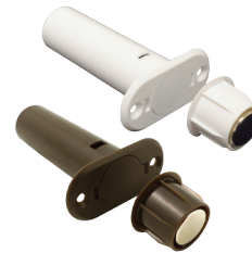
ELK-6023 (White) ELK-6023BR (Brown)