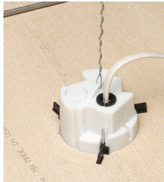
4 Install supplied NM cable connector (1/2" or 3/4"). Pull cable.