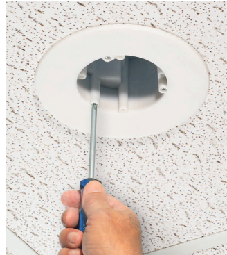
2 Align box as necessary. Tighten mounting wing screws.