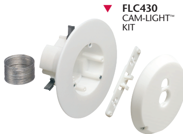
▼ FLC430 CAM-LIGHT™ KIT