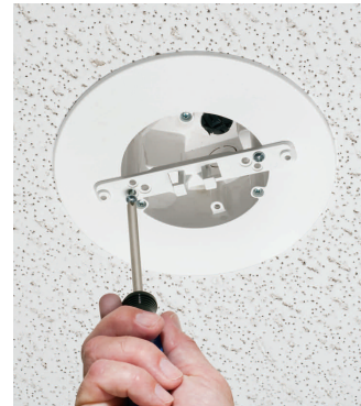
5 Install mounting bracket to inside of box