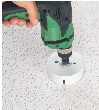
1 Cut hole in the ceiling (tile) with 4" hole saw.