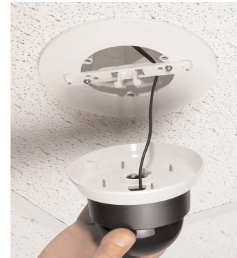
6 Mount camera to mounting plate. Place assembly on bracket. Turn clockwise to lock. Install set screw.

Done! Secure camera installation with no sagging ceiling.