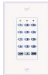
ELK-M1KPAS Arming Station

Features and/or operational characteristics will vary by keypad style.