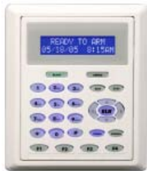
ELK-M1KP2 LCD Keypad