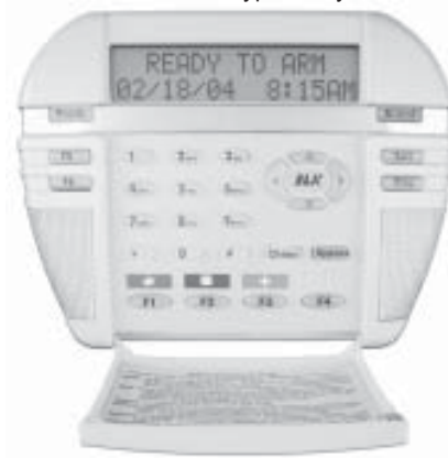
ELK-M1KP LCD Keypad