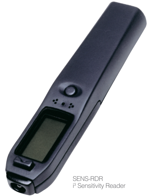
SENS-RDR i 3 Sensitivity Reader