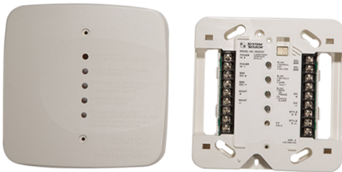
MOD2W i 3 2-Wire Loop Test/Maintenance Module (Pictured with and without cover)