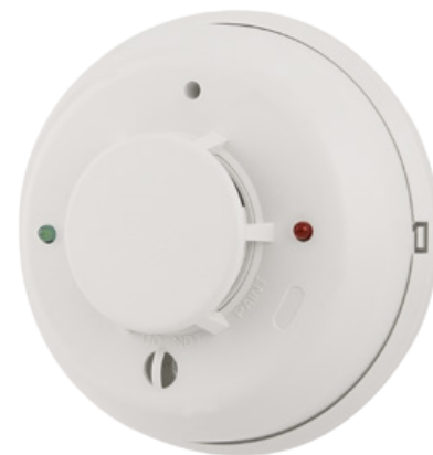
2WTA-B i 3 Series Smoke Detector with Sounder

Simply put, the i 3 Series' principles translate into lower installation, testing, and maintenance costs.