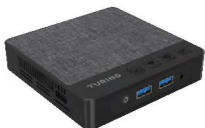
TV-SERVERBM Turing Vision® Mini Bridge

Upgrade to Turing Vision® cloud VMS with the following components